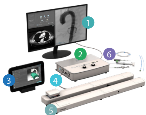
ANGIO Mentor Flex II