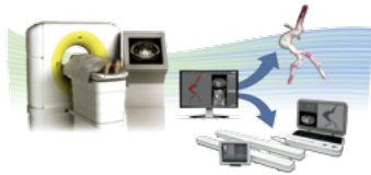
PROcedure Rehearsal Studio™