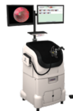
HystSim™ / TURPSim™